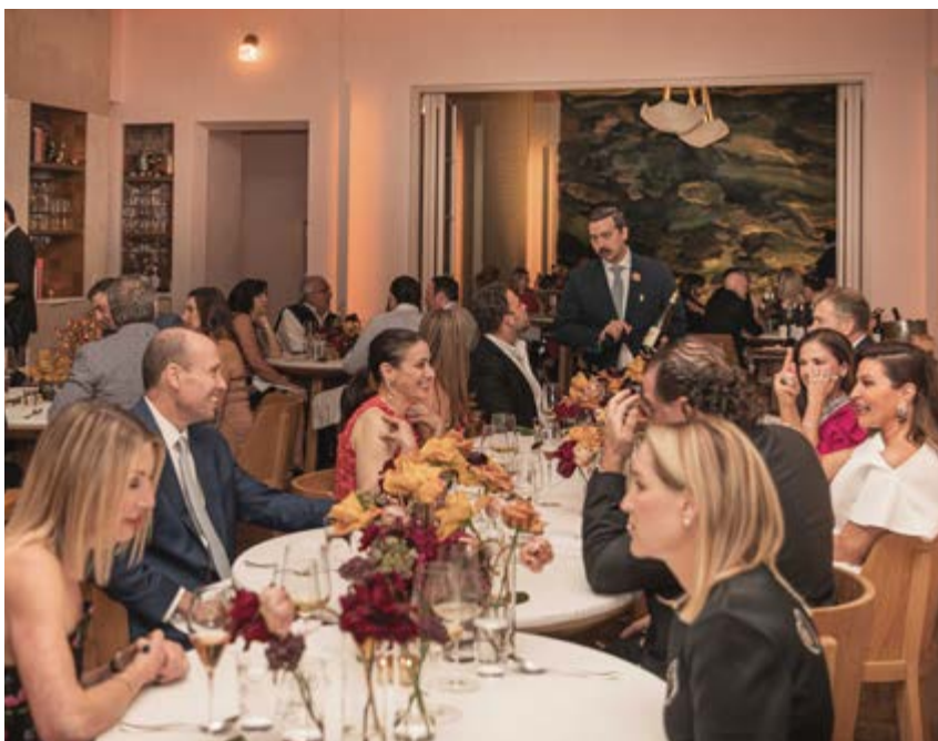
LEFT: A wine dinner in the Private Dining Room at March. ABOVE: A full buyout birthday party at March. RIGHT: The Goodnight Hospitality cellar.

Full buyouts at March are truly magical and bespoke experiences that are built around our 6 or 9 course tasting menu based on our current region of study for the season. Your guests will start with a welcome drink and passed appetizers in The Lounge and move to the dining room for dinner. From caviar stations to champagne carts to sneaking small groups downstairs for a cellar tour, we know you and your guests will never forget your time together at March.