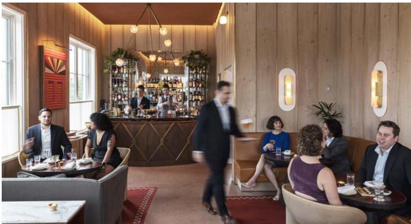
LEFT: A tableside pour. TOP: March's seasonal infused vermouth. ABOVE: The Lounge at March.