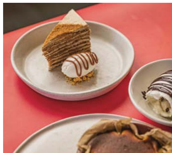
LEFT: Cacio e pepe pizza, farm greens salad, and bolognese. TOP: Dinner spread at Rosie Cannonball. ABOVE: Our honey cake dessert.

Our menu is based on the seasonality and ingredients of our partner farms. Menu may be subject to slight changes by the date of reservations. Menu & guest count confirmations due 48 hours prior to the event. Our team is happy to walk you through our menu and options to account for any dietary restrictions and ensure a memorable experience. *These rates do not include administrative fees (5%), tax (8.25%) & gratuity (22%).