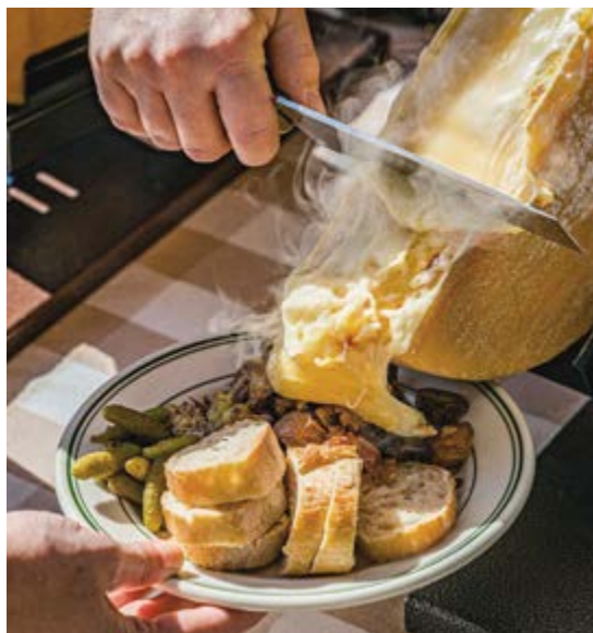
LEFT: The team behind the cheese case at Montrose Cheese & Wine. RIGHT: Freshly melted raclette cheese being scraped onto a plate of food at a Raclette Party at Montrose Cheese & Wine.