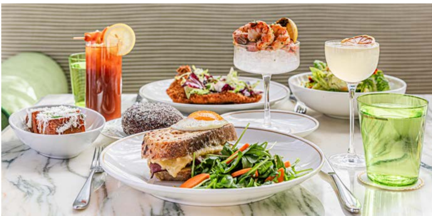
TOP: The Atrium at The Marigold Club set for dinner service. ABOVE: Brunch spread at The Marigold Club.