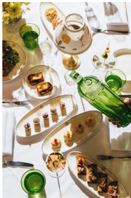
A table spread of snacks.