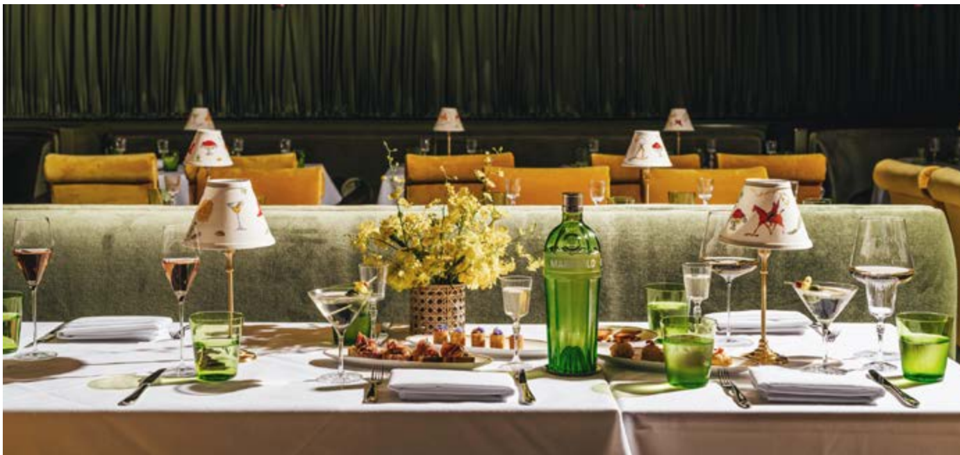
LEFT: The main dining room set for a large party. ABOVE: The central banquette in the main dining room.