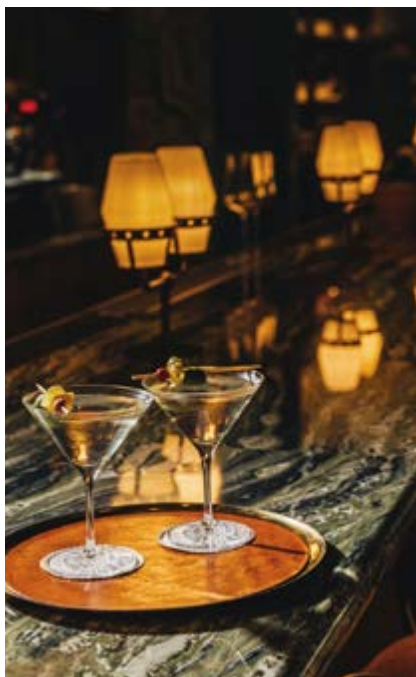
Martinis on the main bar.