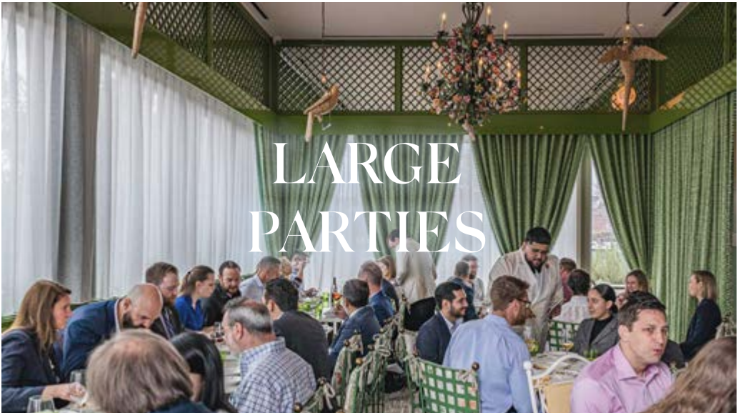
LEFT: The Pink Room at The Marigold Club. ABOVE: The Atrium at The Marigold Club.