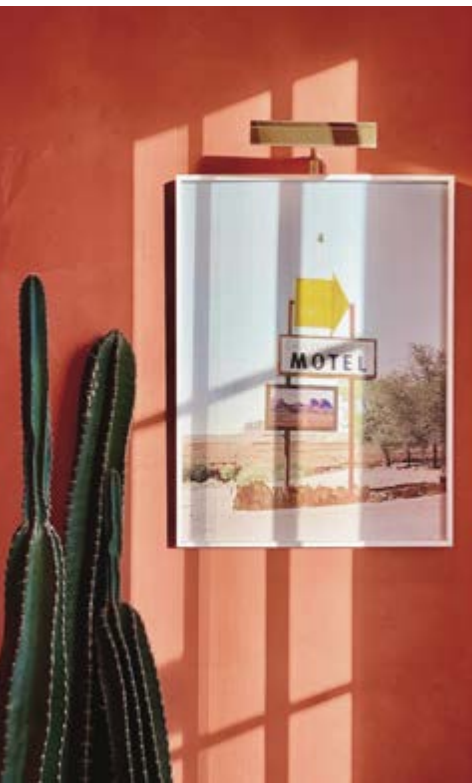
LEFT: Cheese & Charcuterie spread at Montrose Cheese & Wine. TOP: Setup for a wine tasting event at March. ABOVE: The hallway at Rosie Cannonball. RIGHT: Afternoon Tea service at The Marigold Club.