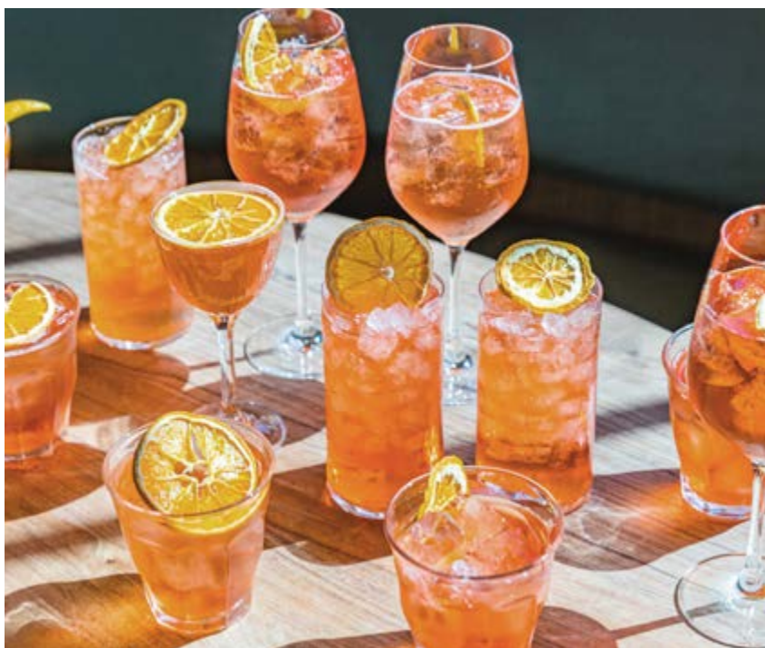
LEFT: A table at Rosie Cannonball set family-style for a large party. TOP: Wine selections at Rosie Cannonball. ABOVE: We love aperol spritz at Rosie Cannonball!