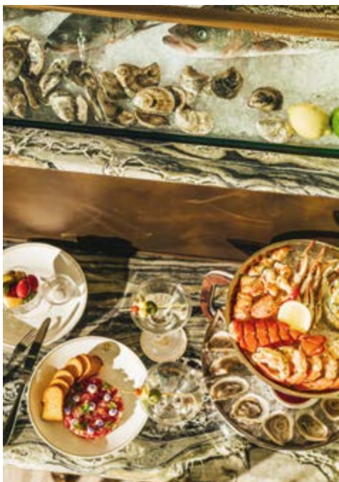
The raw bar set with Fruits de Mer and martinis.