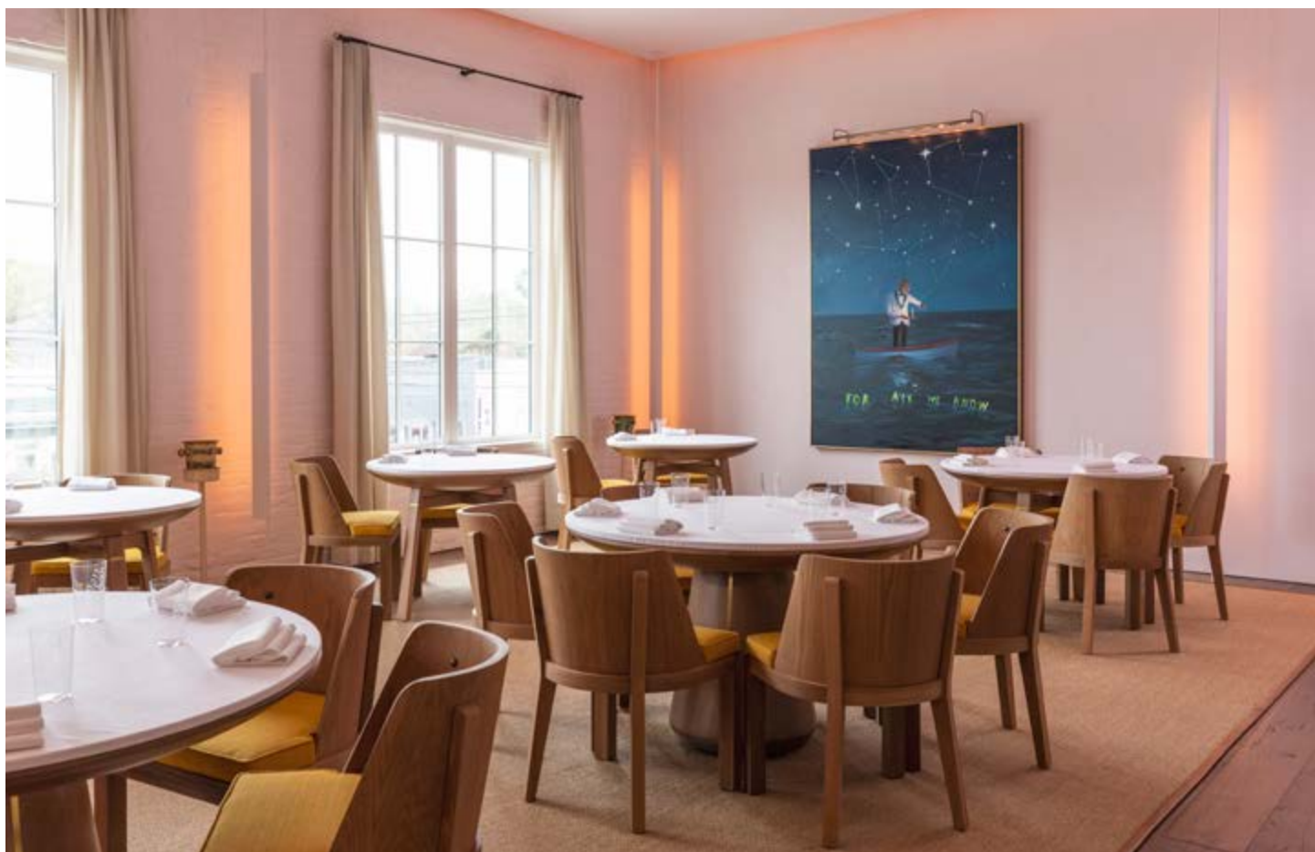
CLOCKWISE FROM TOP LEFT: The bar in The Lounge at March. A view of the March dining room facing into the Private Dining Room. Tables set for service in the March dining room. The Lounge.