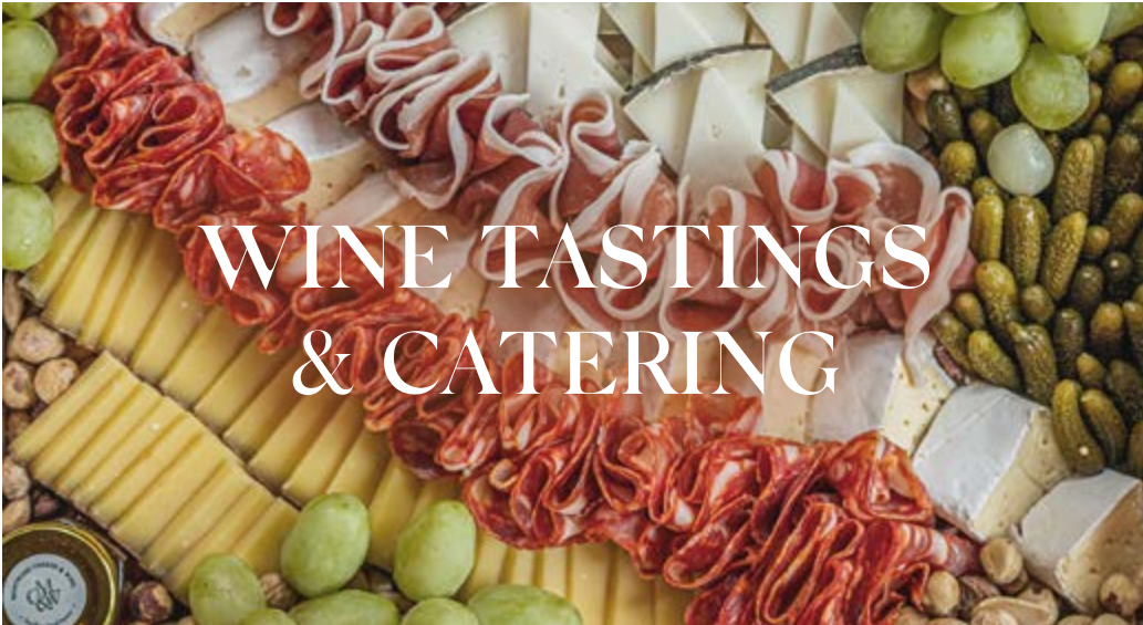
A cheese & charcuterie board from Montrose Cheese & Wine.