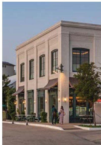
LEFT: A full table of Rosie Cannonball pizza. ABOVE, LEFT TO RIGHT: Matrimonio and a glass of white wine. A selection of rotating house cocktails. The entrance to Rosie Cannonball.