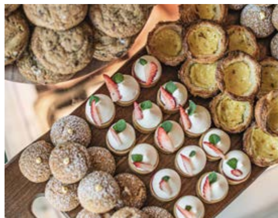
LEFT: A Charcuterie board put together by one of our talented cheesemongers. RIGHT: A spread of pastries for an event.

Build your own cheese & charcuterie board! Kit includes Cheesemonger's choice of three 4oz cheeses, Spanish Ibérico Salami, Lemon Almond & Hazelnuts, Cornichons, Jan's Farmhouse Cranberry Pistachio Crisps, Bee2Bee local honey.