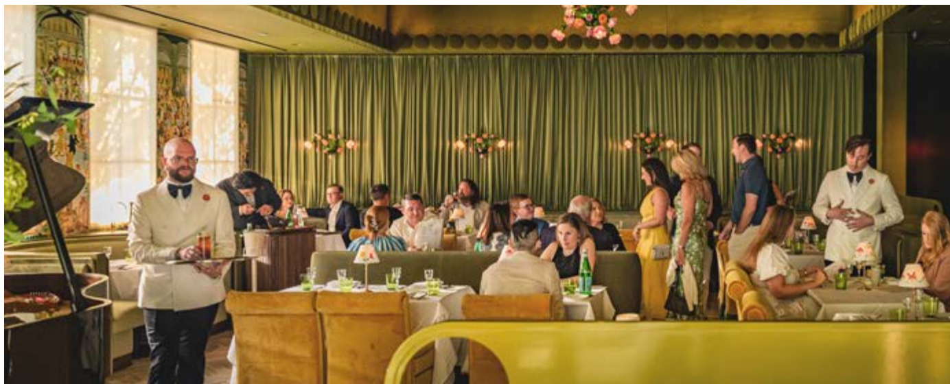
LEFT: Entrées on the table at The Marigold Club. TOP: The bar in the main dining room.. ABOVE: A large party in the main dining room.