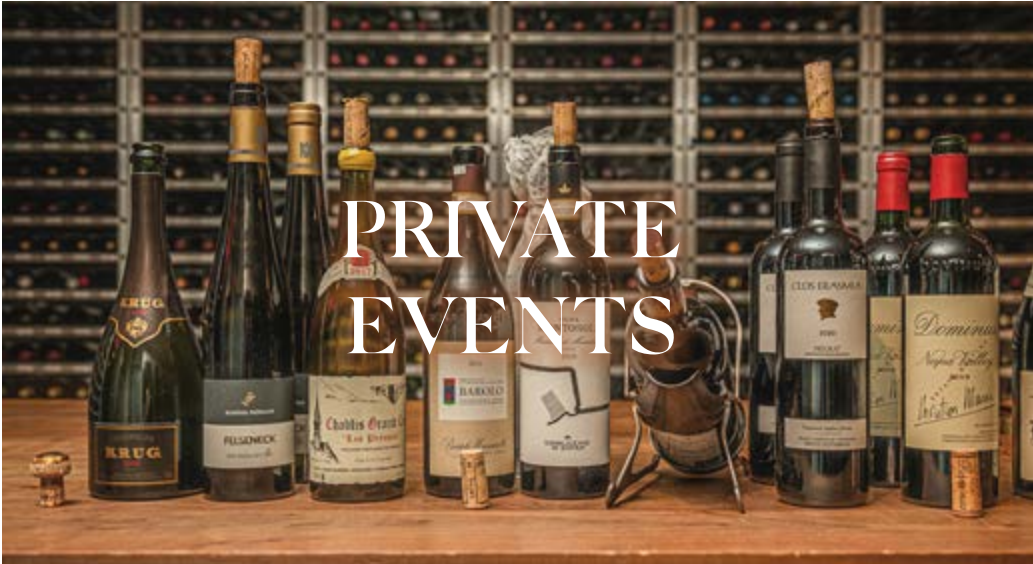
The Cellar set with wines from a private wine event.