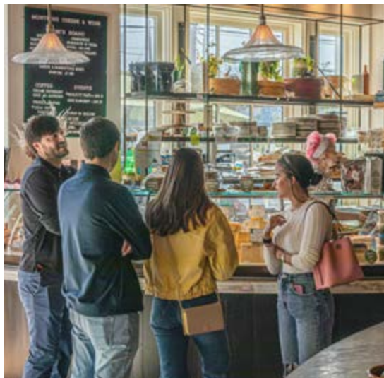
LEFT: Rosé all day at Montrose Cheese & Wine! RIGHT: Guests choosing cheese at the cheese case. OPPOSITE PAGE: Flowers on the patio gate at Montrose Cheese & Wine for a wedding buyout.