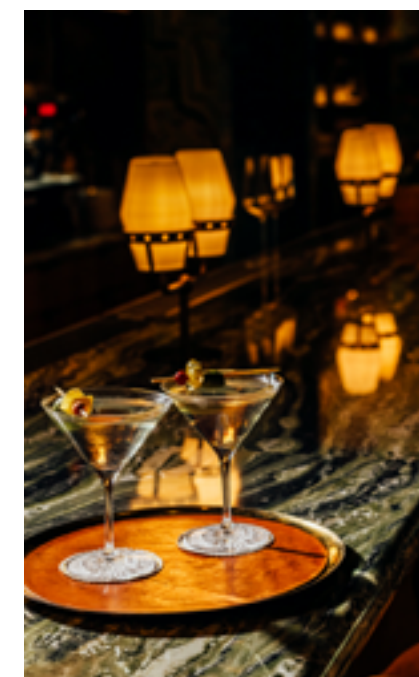
Martinis on the main bar.