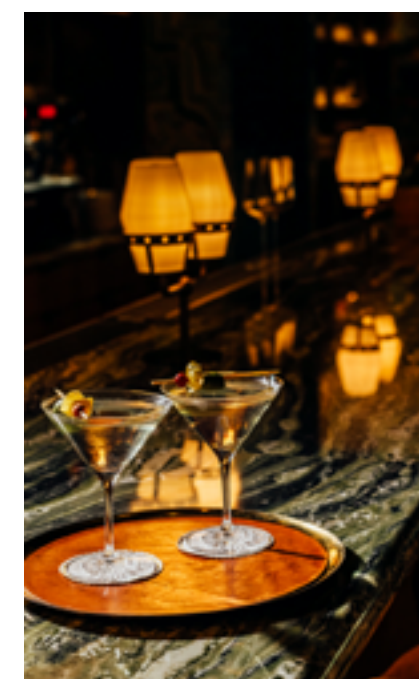
Martinis on the main bar.