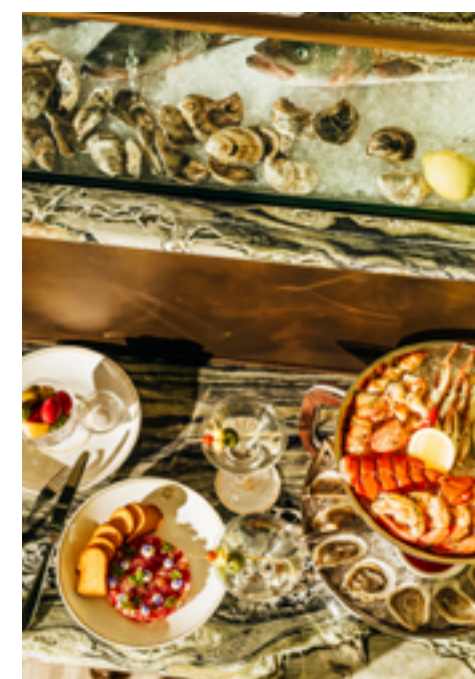
The cold bar.