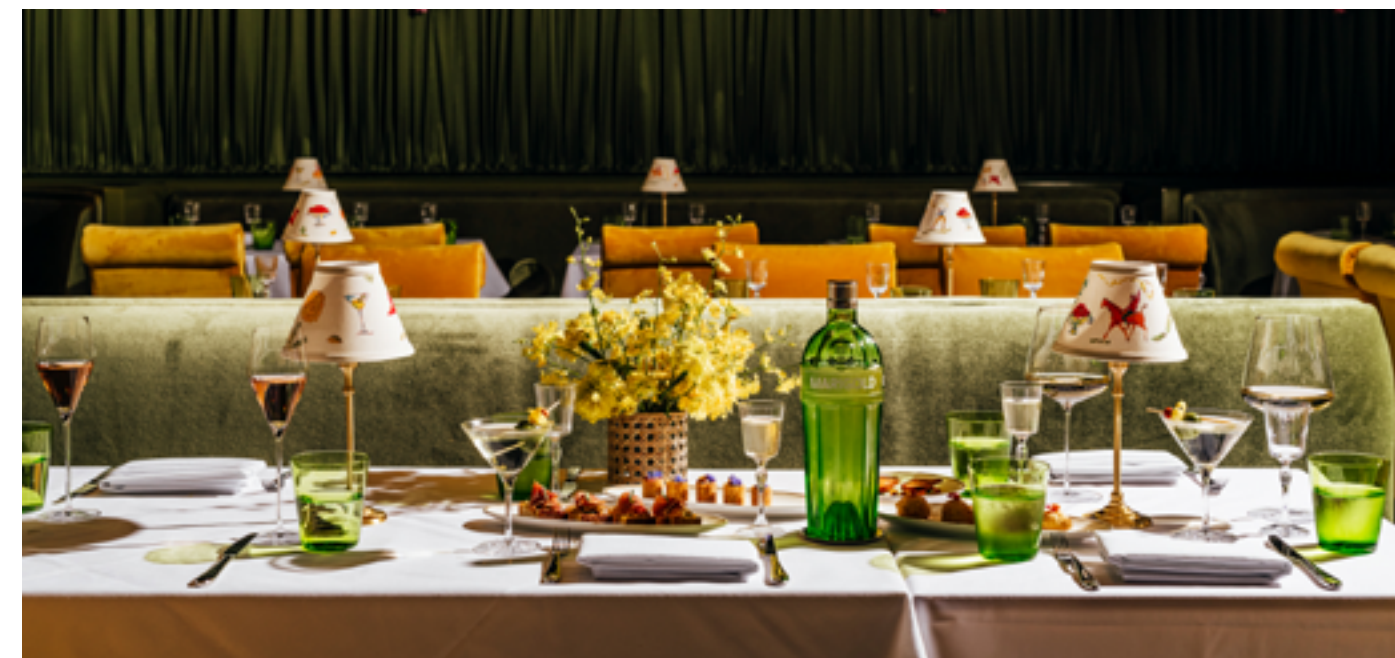
The main dining room.