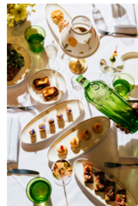
A table spread of snacks.