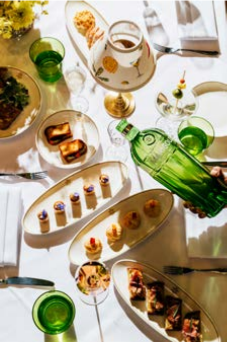
A table spread of snacks.