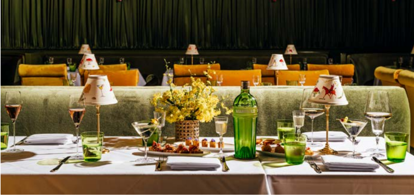
The main dining room.