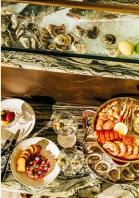
The cold bar.