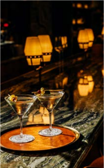
Martinis on the main bar.